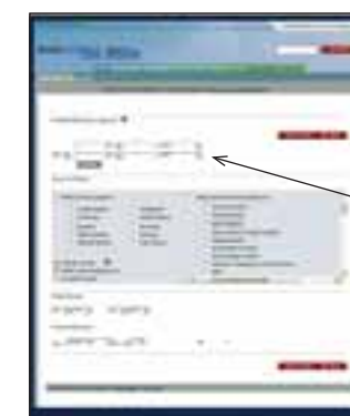
Advanced Search Page