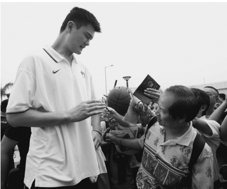
Photo 4.3 Yao Ming's extraordinary height illustrates that the characteristics of an individual do not necessarily follow cultural trends. Regarding their clients' psychological characteristics, culturally competent clinical psychologists appreciate the exceptions as well as the rules.

The average height of a Chinese man is about 5 ft 7 in.—about 2 to 3 in. shorter than the average height of men from the United States. So if you are a clinical psychologist and you know that the new client in your waiting room is a Chinese man, you might expect to see someone around 5 ft 7 in. tall. But when you open the waiting room door and Yao Ming stands up—all 7 ft 6 in. of him—you understand right away that your client is a huge exception to the rule.