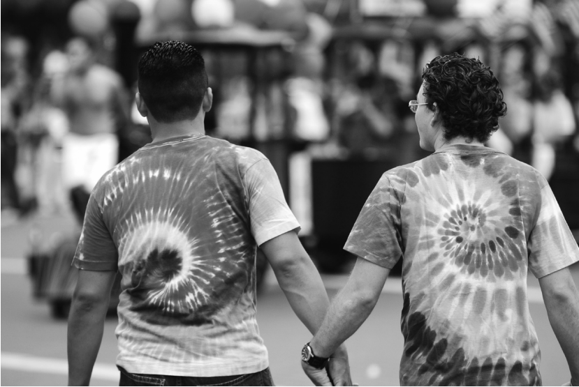
Photo 4.4 In your opinion, what variables should clinical psychologists consider when they appreciate their clients' cultural backgrounds?