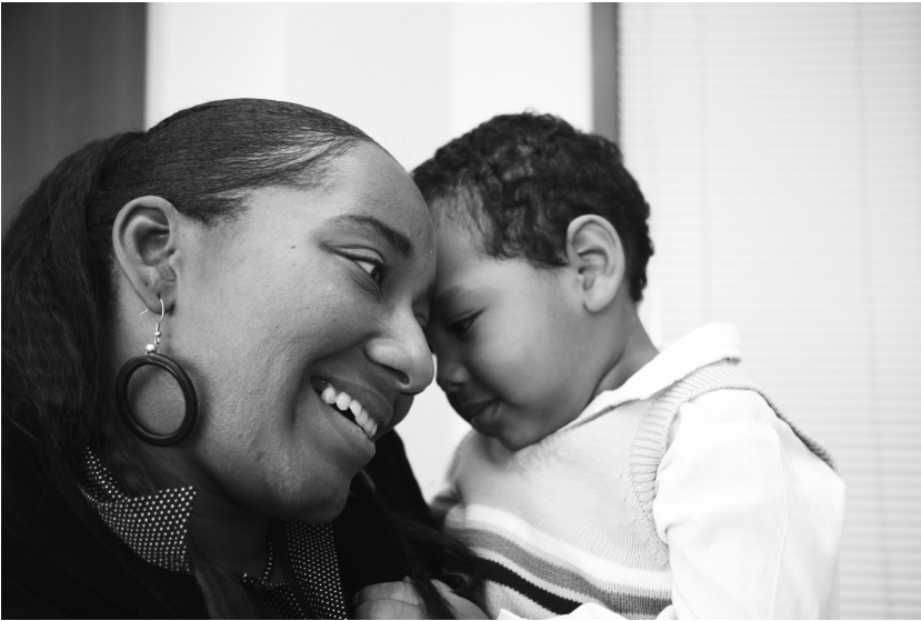
Photo 4.5 The parent-child relationship is a particular aspect of many clients' lives that can differ across cultures.

regarding parent-child relationships are probably influenced by his or her own culture and that those expectations don't hold true for everyone. For example, in some cultures (e.g., British), parenting that produces a child who grows up, moves out, and lives an independent life is usually considered successful. But families of other cultural backgrounds (e.g., Italians) usually prefer that their children stay geographically and emotionally close even after they reach adulthood. Some cultures (e.g., Chinese) tend to insist that children obey parental authority without discussion or negotiation. But families of other cultural backgrounds (e.g., Jewish) tend to create a home life in which open discussion of feelings, including children disagreeing or arguing with parents, is tolerated or even encouraged (McGoldrick et al., 2005a).