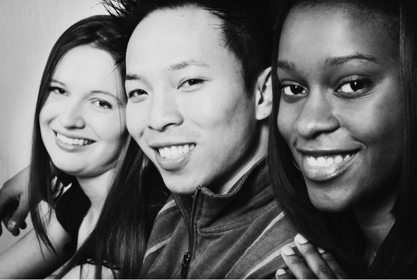
Photo 4.1 Cultural diversity is a hallmark of the U.S. population, especially in certain geographical areas. Clinical psychologists are increasingly recognizing the importance of cultural factors in therapy, assessment, and other professional activities.

In certain parts of the United States, the increasing diversity is even more pronounced. In Miami, for example, Latino/Latina/Hispanic residents represent the majority of the population (U.S. Census Bureau, 2006a). In San Francisco, individuals of Asian descent represent almost one third of the population (U.S. Census Bureau, 2006b). And more than 55% of the populations of Detroit and Washington, D.C. are African American (U.S. Census Bureau, 2006c, 2006d).