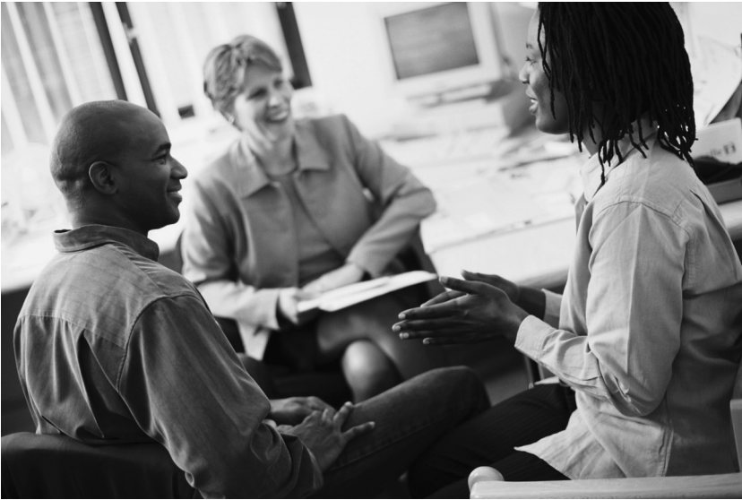
Photo 4.2 Cultural self-awareness, or an appreciation of the clinical psychologist’s own unique cultural viewpoint, is a key element of cultural competence.

Of course, the process of cultural self-awareness can be difficult or unpleasant for psychologists, because it may require admitting and coming to terms with some undesirable “isms”—racism, sexism, heterosexism, classism, or similar prejudicial or discriminatory belief systems that we’d rather pretend we didn’t have. But by examining them and exposing them to ourselves, we can take steps toward minimizing them and the negative impact they might have on our clients.