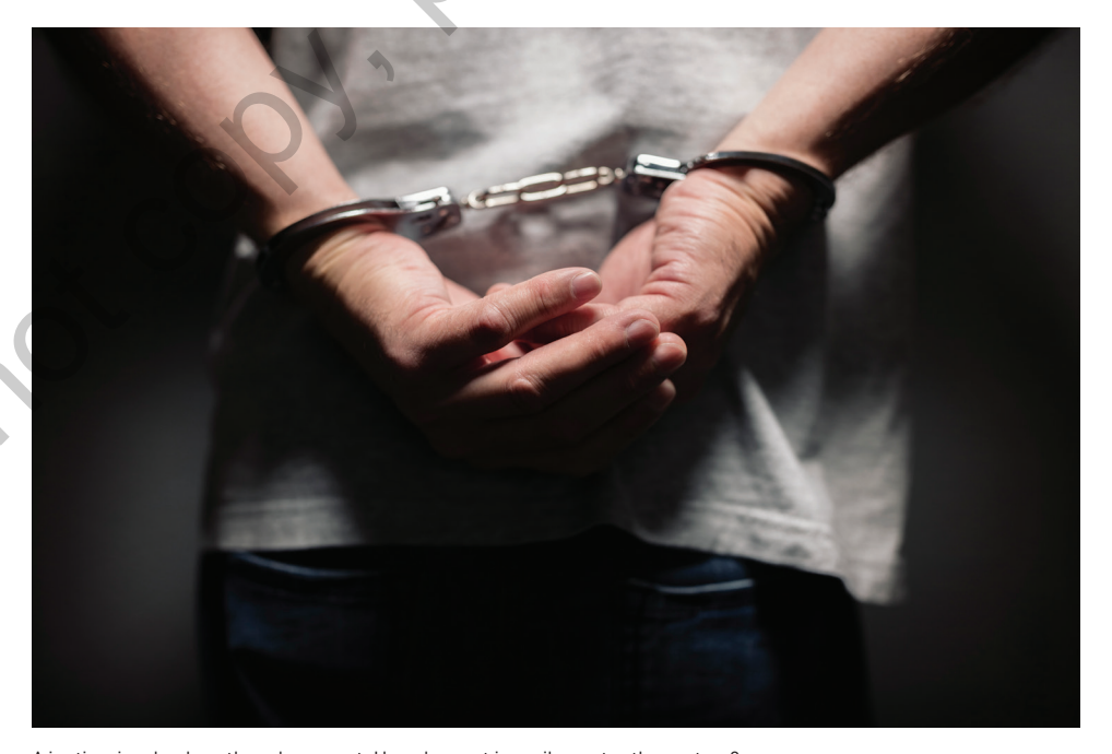
A justice-involved youth under arrest. How do most juveniles enter the system?

Reports of criminal offending rates were erratic and unreliable for decades until jurisdictions began to formalize reporting procedures. Authorities in Maine, Massachusetts, and New York were the first to collect official crime statistics. Other states and localities attempted to publish crime rates, but the information was not valid enough to determine the actual crime level. In other words,