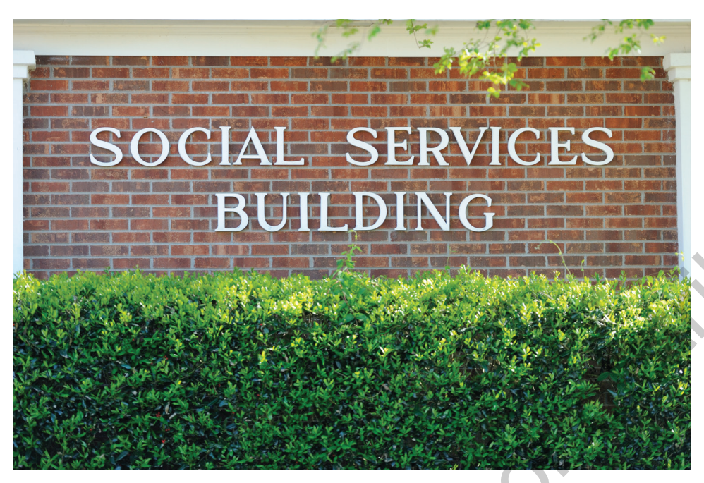
The entrance to a social services agency. What kinds of services are available to juveniles and their families?

who were victimized by juvenile facility staff, over 20% had been given drugs or alcohol to coerce them into sexual activity.<sup>17</sup>