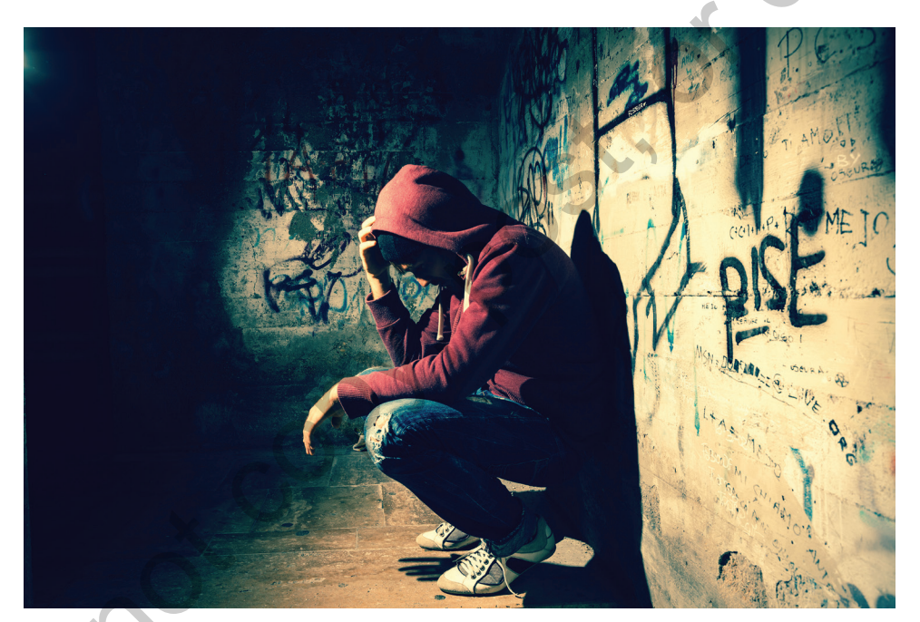
A justice-involved youth. Why do justice-involved youth often feel hopeless and alone?

It is important to understand the terms associated with the initiation, continuation, and ceasing of delinquent behavior, otherwise known as the stages of delinquent behavior. Age of onset is the age a juvenile first begins committing delinquent acts. For example, if a female commits her first act of shoplifting at age 13 by stealing a candy bar from a grocery store, 13 years old is her age of onset. Research has indicated that juveniles who begin offending at an earlier age are more likely to continue offending into their adult years. A juvenile who begins offending at age 14 is more likely to continue criminality as an adult, compared with an individual who begins at age 17. Age of onset can differ depending on the type of crime. The average age of onset for gang membership is 15.9 years old, followed by marijuana use at 16.5 years old and gun carrying at 17.3 years old.