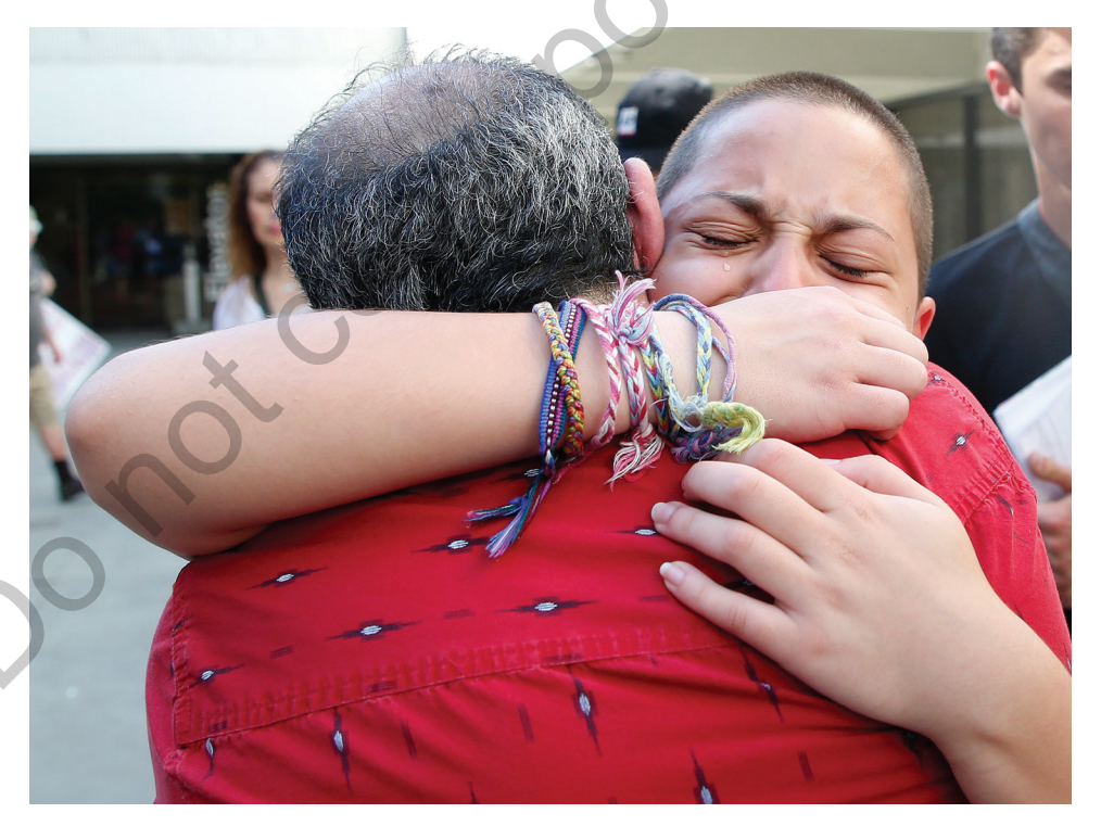
A parent hugs his child following a school shooting. Why is school violence so common today?

The NCVS surveys almost 135,000 households and 224,520 individuals ages 12 and older on their experiences with crime victimization, including rape, robbery, assault, and domestic violence (see Figure 2.3).<sup>27</sup> Each household was interviewed in 2019 and 2020. The study projected that this population experienced a decrease in violent victimization from 21.0 victimizations in 2019 to 16.4 victimizations in 2020 (per 1,000 persons). It is especially notable that the rate of violent victimization against persons under the age of 18 declined 51% between 2019 and